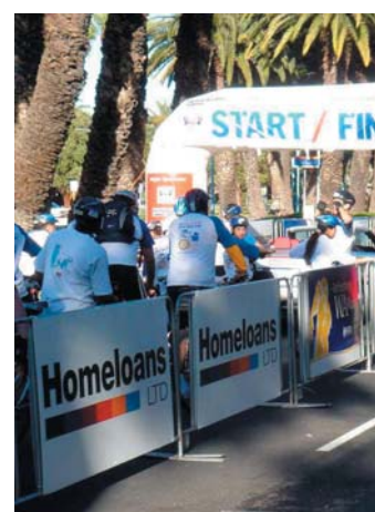
Great Bike Ride - Perth with Homeloans Ltd as naming rights sponsor

For the second year in a row, the year in review saw a tightening of the mortgage market. This resulted in an increased focus by our competitors on refinancing borrowers from other lenders. We are pleased to advise that in an increasingly competitive market our retention levels have improved due to an assertive retention strategy and ongoing commitment to providing the best possible personal service to our customers.